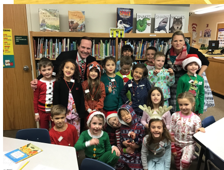
Polar Express Day