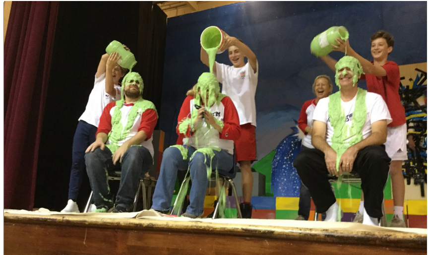
Faculty members were slimed at the Walkathon Kick-Off Assembly.